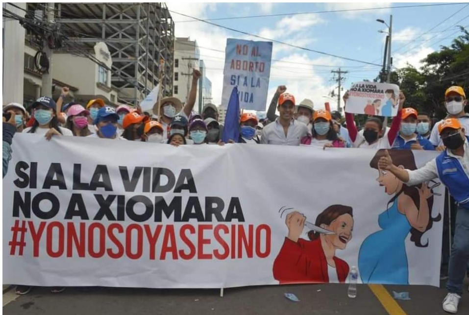
The banner reads: "Yes to life, no to Xiomara. #I am not a Killer"

The issue of abortion majorly polarised these elections with Xiomara Castro and other members of the Libre Party facing vicious, hateful attacks for being in favour of reproductive rights.