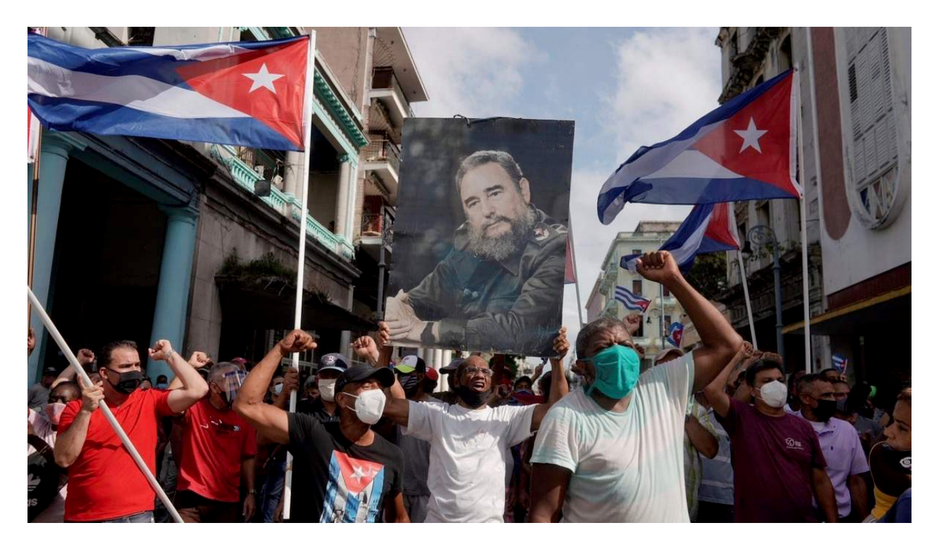
Cubans demonstrate to defend the socialist government and the revolution.

On July 11, protests broke out in different parts of Cuba. The people came out on the streets demanding answers for legitimate problems — insufficient access to food and medicines, frequent electricity outages, etc. The pandemic is a major factor fuelling this social crisis. The main culprit, however, is the crippling economic blockade imposed by the US which restricts sharply the Cuban government's power to purchase the basic necessities that the protestors were demanding.