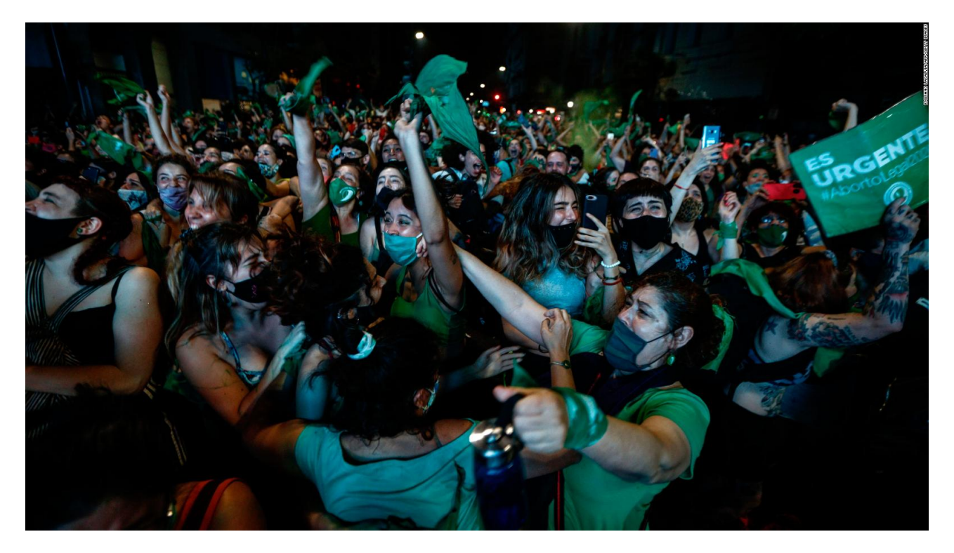
When the approval of the bill was announced, a collective joy exploded among those present.

The most affected by these unsafe, clandestine abortions are poor women. According to reports, more than one poor woman a day dies from a clandestine abortion as these are performed in poor sanitary conditions.