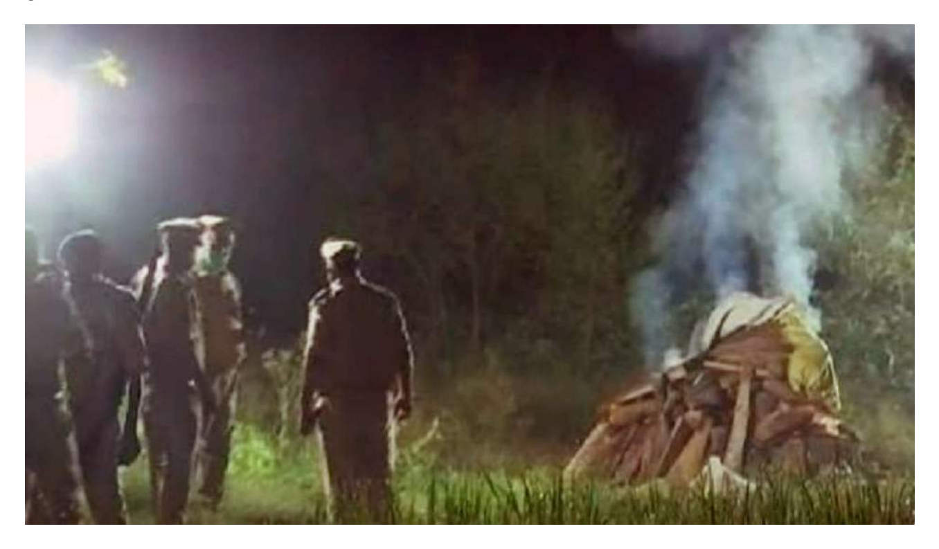
UP police cremating the Hathras rape victim in the dead of night against the wishes of her family.

What constitutes rape and the steps that need to be taken in investigation of this offence need to be clearly understood to see the manner in which the UP Police and administration have been in the Hathras case misleading people regarding the law of the land. There have been serious allegations that the UP police have deliberately botched up the investigation to protect the accused who belong to upper caste Thakurs in the village and have close connections with the UP government and administration.