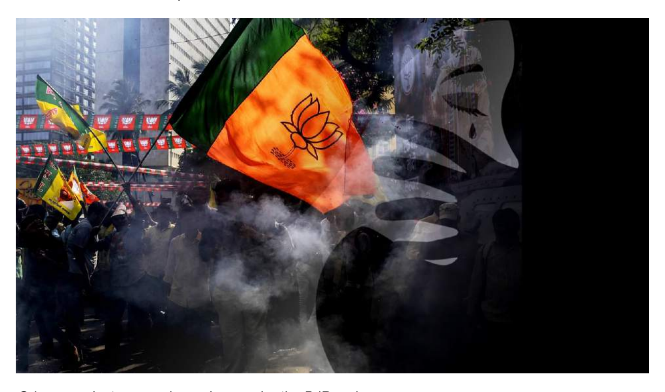
Crimes against women have risen under the BJP regime.

Women have been subject to discrimination and barbarities for many centuries. But under the BJP regime in our country the overthrow of the rule of law and Constitution has taken atrocities against women beyond all limits. In the year 2011, India was ranked 5th in cases of violence against women and sexual harassment by some global surveys, but according to the same surveys for the year 2018 India was on top of the list leaving Syria and Afghanistan behind. Even according to the NCRB report, more than 32,000 rapes were reported in 2019, in which 11% victims were from Dalit castes. In our country in the last 10 years, there has been an increase of 31% in rape cases.